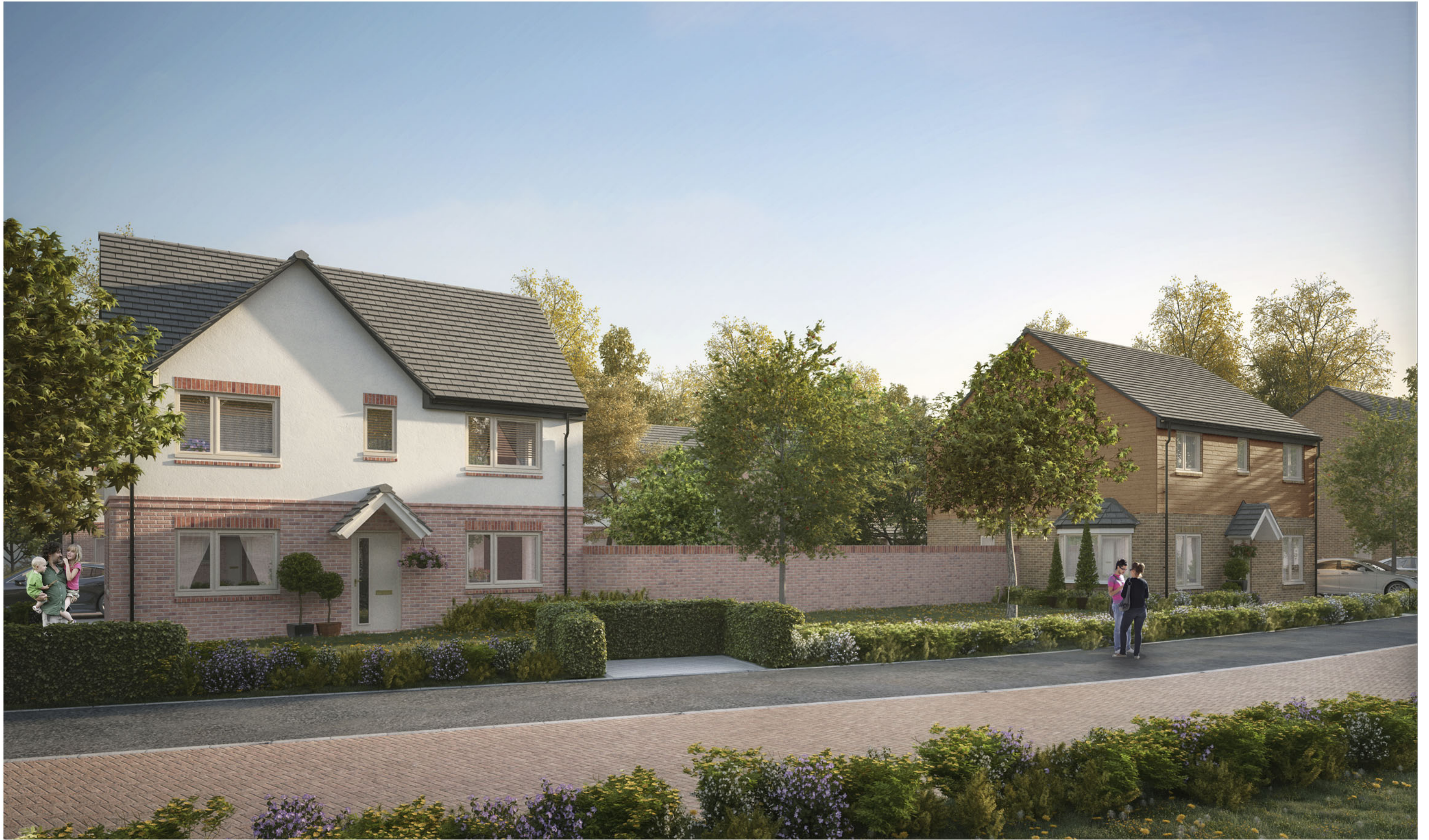
Donnington Wood Way, Telford - Parcel B View 2